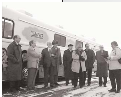
Attendants at the ribbon cutting listen as a representative of the Berks County Chamber of Commerce presents a plaque to the Blood Center in celebration of their new bloodmobile.